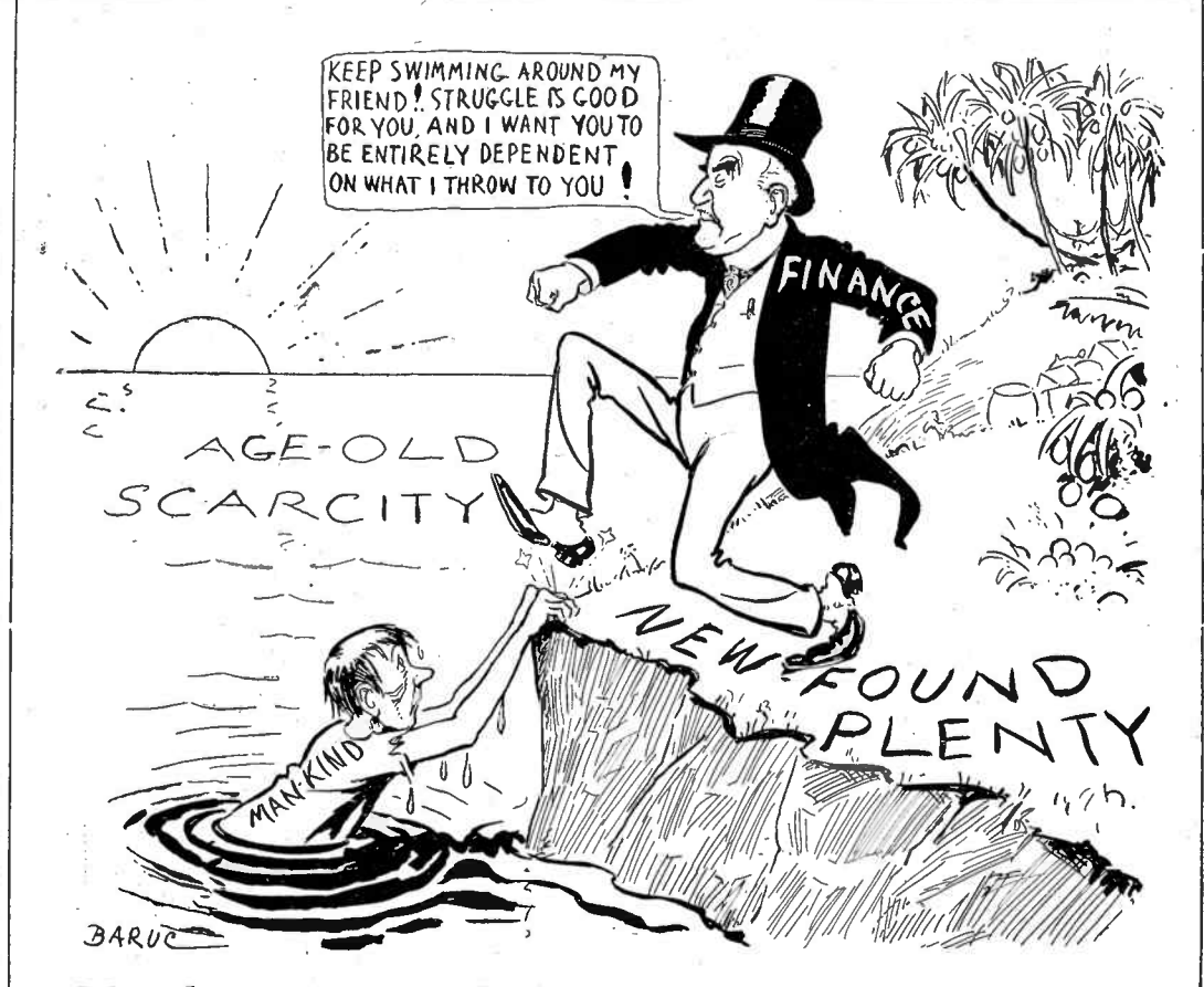
Man having attained Plenty finds himself being kicked back into the water by Finance.

Increment of Plenty Worshipping Work £8,500,000 a Year - The Car of Juggernaut This Day's Madness -- 60 - 60 - 61 Active Service - 62